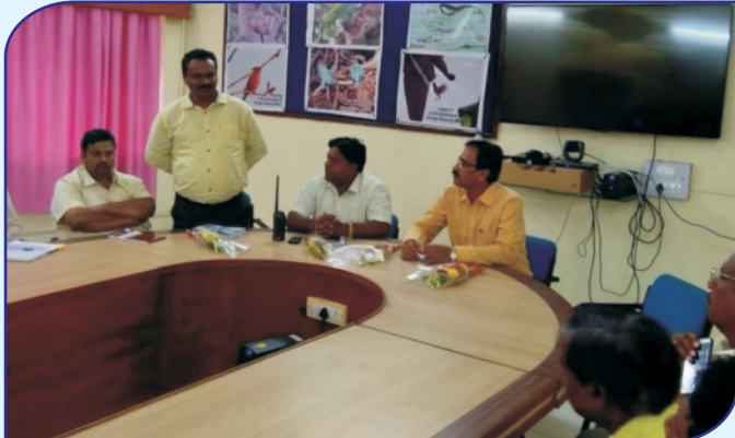
Vigilance training Programme at Dongri Buzurg Mines